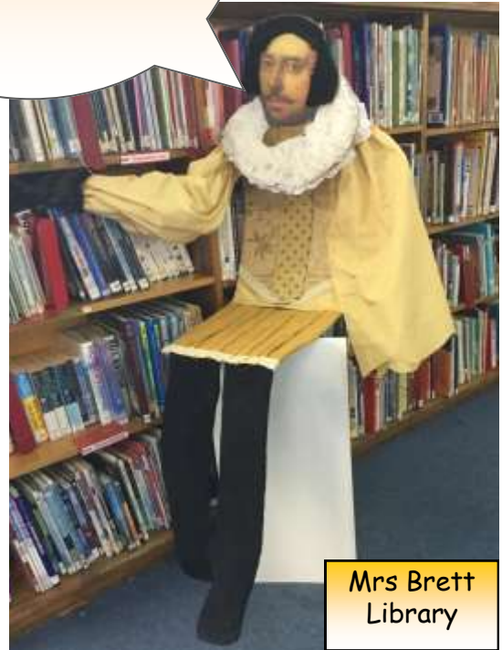
Mrs Brett Library

POLITE NOTICE : The Library opens from 8am. Students arriving earlier must wait in Reception please.