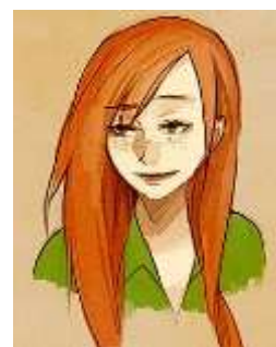
Charlotte (Ginny Weasley) Longland