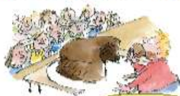
WHIPPLE SCRUMPTIOUS SPLENDIFEROUS CAKE COMPETITION, SALE & RAFFLE

8R, 8B and 8E participated in our Focus Day Sessions inspired by the old adage 'don't judge a book by its cover' and had fun discussing which books in different genres they would choose to read and why. Identifying the mystery books was a challenge and a few rips mysteriously (!) appeared in our sealed envelopes. We were able to introduce pupils to new books and several asked to borrow these at the end of the sessions; a good result.