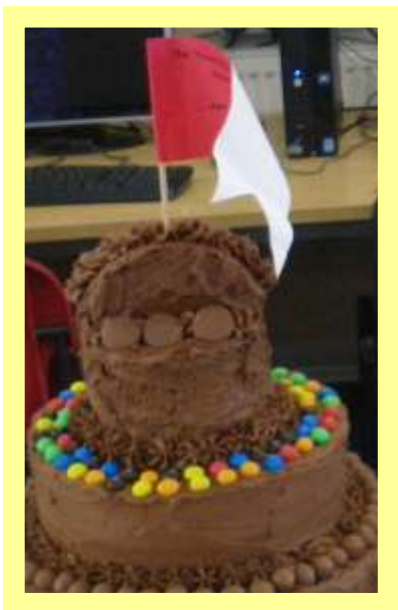
The Trunchbull's Chocolate Choc-tastic Cake, our Library showstopper from Toby Richards (7R)

This gorgeous cake tasted as good as it looked and when carefully sliced and sold, raised almost £40!